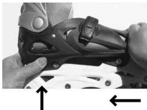
Push the tip (regulation button)