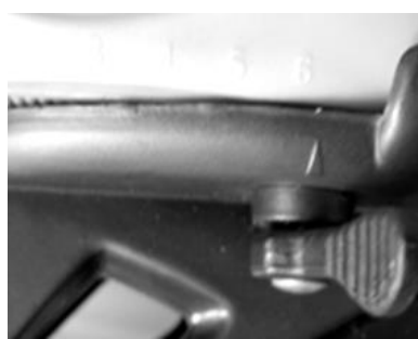
Release the lever