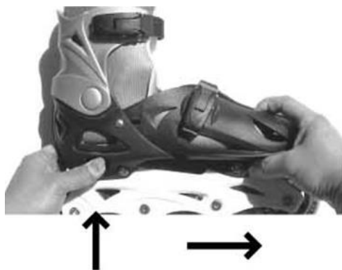
Pull the tip (regulation button)