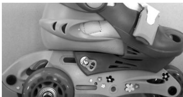
Secure the lever