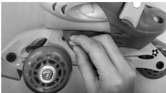
Release the lever